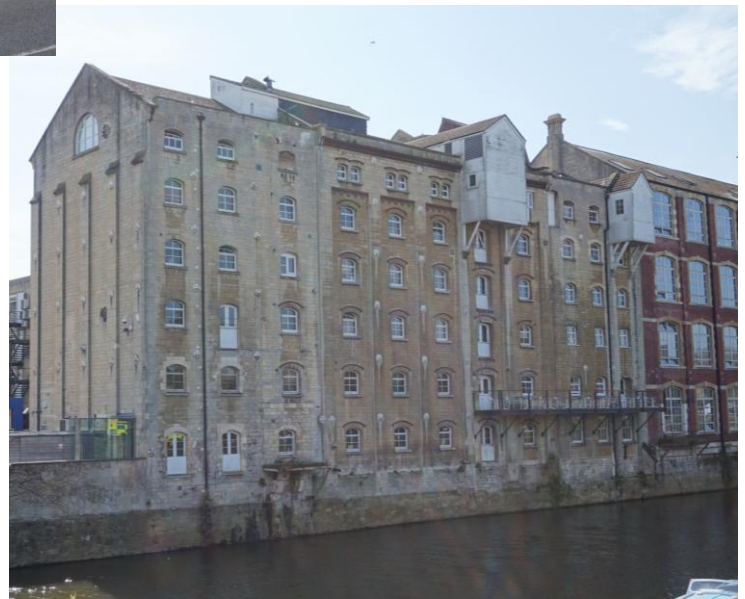
Four Lyncombe and Widcombe Mills